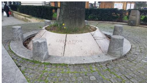
Fig. 7: Plaque 2 at the base of the Tree of Liberation