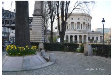
Fig. 5: Tree of Liberation