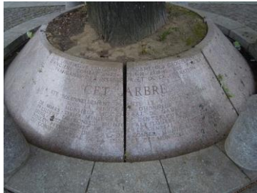
Fig. 6: Plaque 1 at the base of the Tree of Liberation