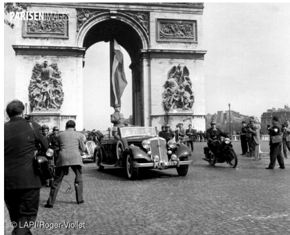
Fig. 8: de Gaulle's visit

Then de Gaulle then returned to his car and made the round of the place, warmly applauded, before finally turning down avenue de la Grande Armée out of sight of the crowd. After his departure cars and traffic were allowed back onto the road and the crowd began to disperse.