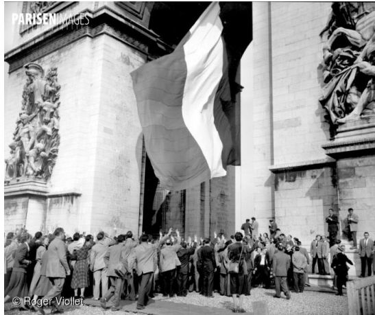
Fig. 9: Gaullists at the Arc de Triomphe

in reaching the off-limits traffic circle where they also sang “La Marseillaise.” Some voiced intentions to gather at the Elysée palace – the official resident of the French President, just a few blocks from the Champs-Élysées – but this call was not followed. Several security officers attempted to control the group and asked them to leave. 117 In Figure 9, we see this crowd gathering at the base of the Arc – while off to the right a police officer rushes to confront them.