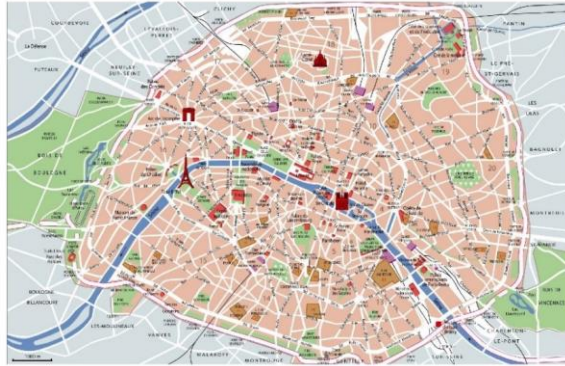
Fig. 1: Map of Paris