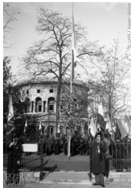
Fig. 4: Planting of the Tree of Liberation at Place Stalingrad in 1945 Source: LAPI/Roger-Viollet "Plantation d'un arbre de la libération. Stalingrad, novembre 1945," Pariszigzag , January 26, 2016. https://www.pariszigzag.fr/histoire-insolite-paris/evolution-de-la-place-stalingrad-en-images

As representatives of the government's interest, these concerns can be used as evidence for broader concerns present in this era. The fact that there is both a censorship of even silent dissidence, in the case of the bouquet, as well as preparation for possible subversive activity by political dissidents shows that the ceremonies and commemoration were about much more than remembering World War II and in fact functioned as sites of tension, disputes and power struggles.