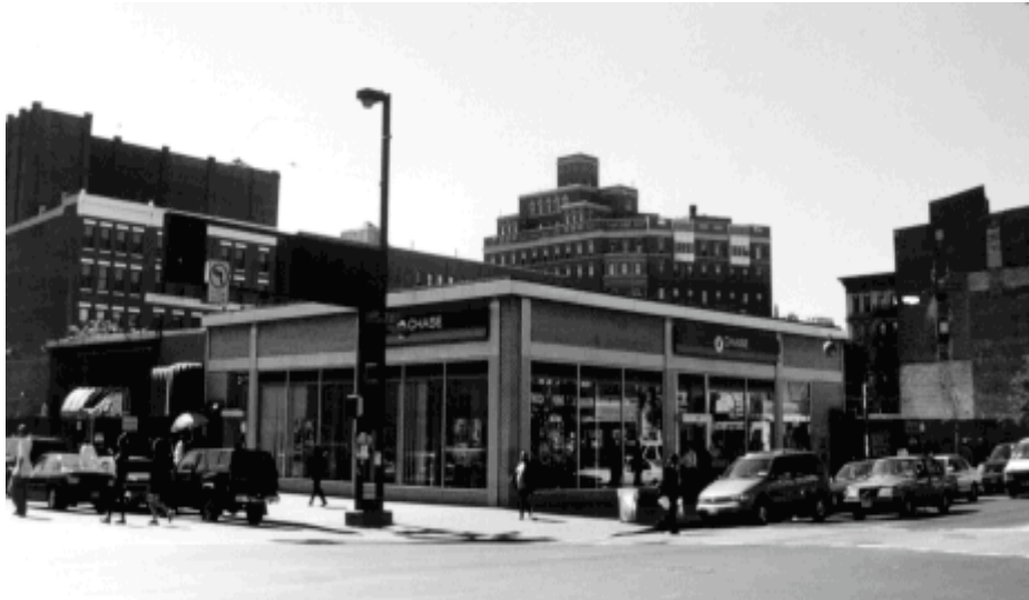
The Harlem USA site before Construction Source: 1996- 1999 Annual Report

it was the most significant commercial development that Harlem had seen in decades. It drastically changed the landscape of 125 th street. What had previously been a few stores and a large empty lot was now a vibrant commercial center. The following images show the construction site of Harlem USA before and after the development of the project.