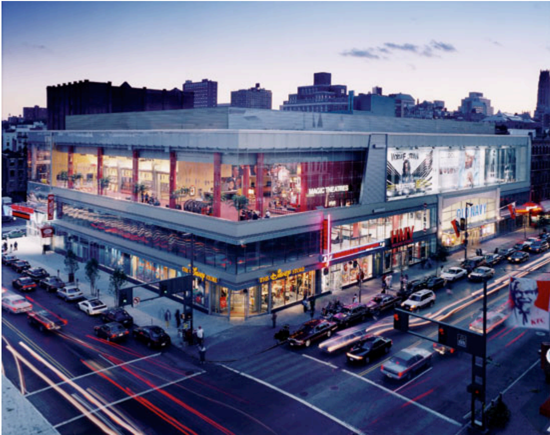
Harlem USA after construction: 2000