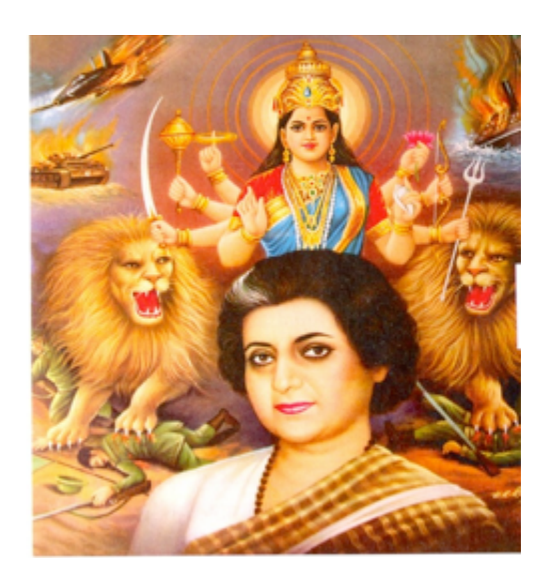
Figure I: Indira Gandhi and Durga. Reprinted from The Goddess and the Nation by Sumathi Ramaswamy<sup>45</sup>

In Figure 2 Indira, held by a black, weeping, female India bleeds onto the nation. Inscribed next to the map is a version of Indira's last words "when my life is gone, every drop of my blood will strengthen the nation." Her face is wrenched with pain and anguish, an expression similar to other portrayals of Mother India under assault. The portrayal of Indira Gandhi as a martyr situates her in the trope of ideal, sacrificial womanhood that had been established during the independence struggle. The image of pain and sacrifice is clearly reminiscent of