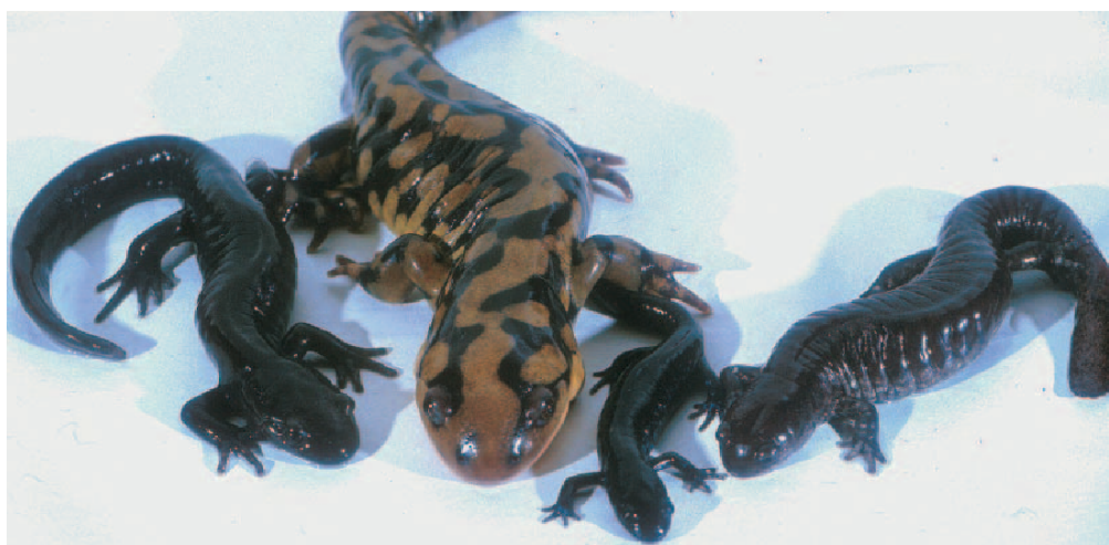
Figure 1. Four Ambystoma species male salamanders

The Ambystoma laterale-jeffersonianum complex of New England features a combination of sexual and unisexual salamanders, whose unisexual population relies on the sexual population for both sexual and asexual reproduction. Through sexual reproduction, unisexual and sexual gene pools interact, generating hybrid offspring ranging in ploidy from haploid to pentaploid. Though these hybrids can mature into viable, phenotypically normal adults, the vast majority die during early embryogenesis, around the time of the first cleavage event. The cause of this mortality is currently unknown. Here, I will discuss embryonic development of different animals, possible genetic or environmental explanations for Ambystoma hybrid embryo mortality, and steps that may be taken to investigate this phenomenon in the future.