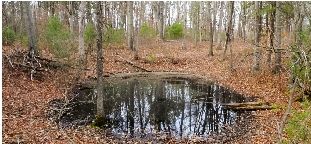
Figure 4. A vernal pool in the state of Massachusetts

A typical vernal pool in New England. (Commonwealth of Massachusetts, 2021).