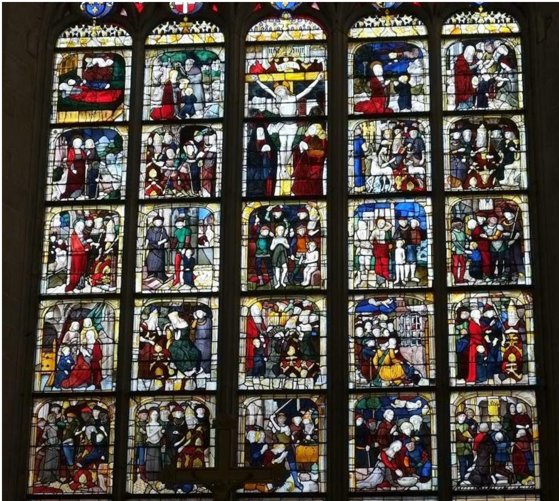
Figure 6. 15 th century stained glass from Issoudun, mostly following Version 1 (“Bleiglasfenster in der Kirche Saint-Cyr in Issoudun im Département Indre in der Region Centre (Frankreich),” image courtesy of Wikimedia Commons,

https://commons.wikimedia.org/wiki/Category:Stained_glass_windows_of_%C3%89glise_Saint-Cyr_d%27Issoudun?uselang=fr#/media/File:Issoudun_Saint-Cyr_3946.JPG ).