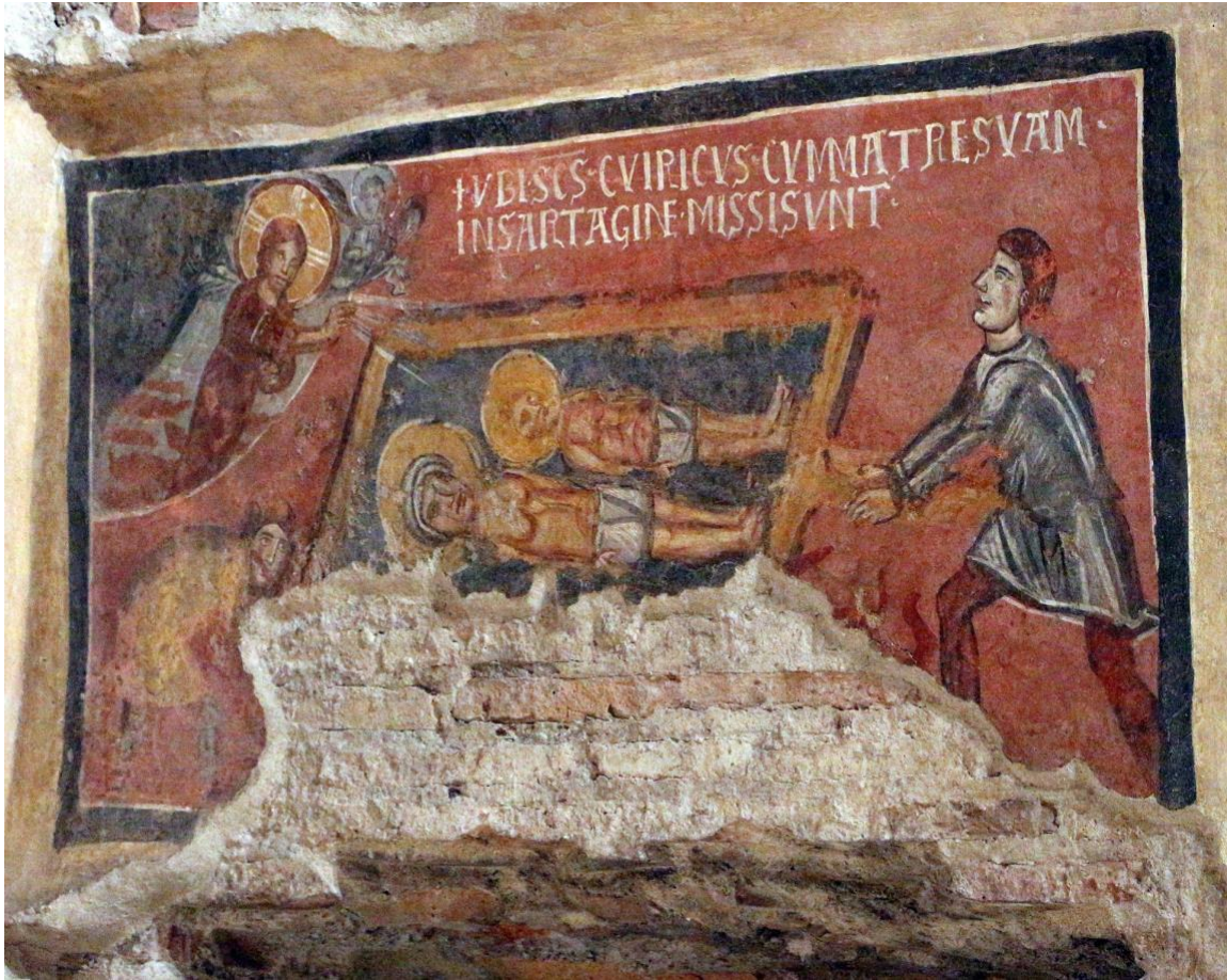
Figure 4. “Where Saint Quiricus and his mother are sent into the frying pan” 570 (Photo by Francesco Bini, “Età di papa zaccaria, cappella del primicerius teodoro, storie dei ss. quirico e giulitta, 741-752, 06,” image courtesy of Wikimedia Commons, https://commons.wikimedia.org/wiki/File:Et%C3%A0_di_papa_zaccaria,_cappella_del_primicerius_teodoro,_storie_dei_ss._quirico_e_giulitta,_741-752,_06.jpg ).