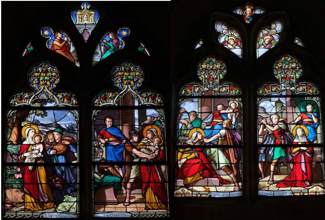
Figure 8. Stained glass from Issoudun depicting Version 2, added in 1868 572 (“Bleiglasfenster in der Kirche Saint-Cyr in Issoudun im Département Indre in der Region Centre (Frankreich),” images courtesy of Wikimedia Commons,

https://commons.wikimedia.org/wiki/Category:Stained_glass_windows_of_%C3%89glise_Saint-Cyr_d%27Issoudun?uselang=fr#/media/File:Issoudun_Saint-Cyr_3928.JPG , https://commons.wikimedia.org/wiki/Category:Stained_glass_windows_of_%C3%89glise_Saint-Cyr_d%27Issoudun?uselang=fr#/media/File:Issoudun_Saint-Cyr_3929.JPG ).