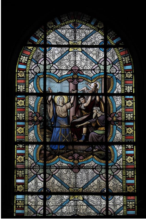
Figure 10. Stained glass depicting Version 1, from the church of Saint-Cyr-Sainte-Julitte in Villejuif, France (“6 verrières à personnages,”).