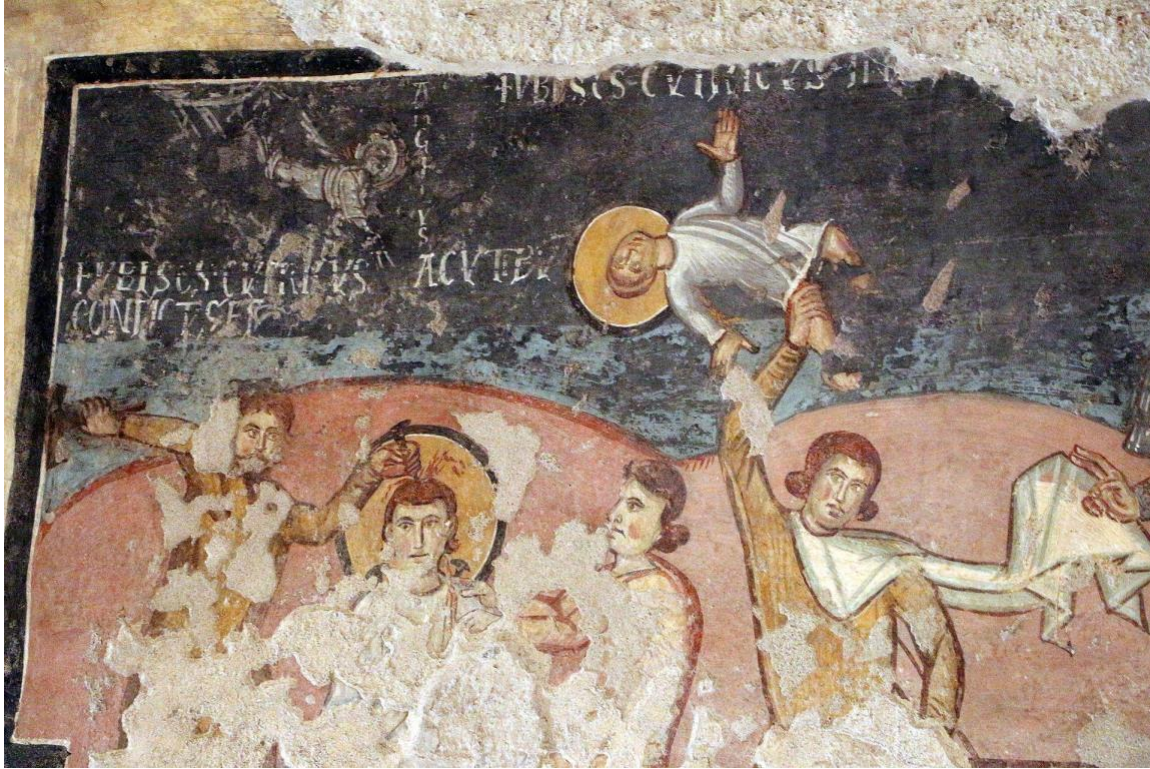
Figure 5. Cyricus, portrayed as an adult, is “tortured with nails” on the left. 571 On the right, the saint, here shown as a child, is thrown to the ground, as in Version 2. The inscription for this episode was on the top of the fresco and is mostly destroyed (Photo by Francesco Bini, “Età di papa zaccaria, cappella del primicerius teodoro, storie dei ss. quirico e giulitta, 741-752, 10,” image courtesy of Wikimedia Commons, https://commons.wikimedia.org/wiki/File:Et%C3%A0 di papa zaccaria, cappella del primicerius teodoro, storie dei ss. quirico e giulitta, 741-752, 10.jpg ).