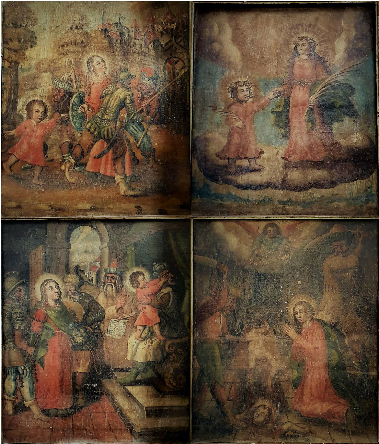
Figure 11. 17 th century Spanish altarpiece depicting Version 2 (“Composición con la vida y martirio de Santa Julita y San Quirico en el Altar Mayor,” image courtesy of Wikimedia Commons, https://commons.wikimedia.org/wiki/File:Composici%C3%B3n_Vida_y_Martirio_de_Santa_Julita_y_San_Quirico_-_Villamelendro_de_Valdavia_001.jpg ).