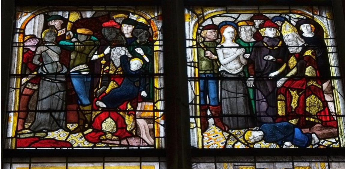
Figure 7. The bottom two panes of the older Issoudun stained glass. On the left, Julitta is beaten while Cyricus strikes the governor's face. On the right, Cyricus has been thrown to the ground by the governor as Julitta prays ("Issoudun Saint-Cyr 3919," image courtesy of Wikimedia Commons, https://commons.wikimedia.org/wiki/File:Issoudun_Saint-Cyr_3919.JPG?uselang=fr ).