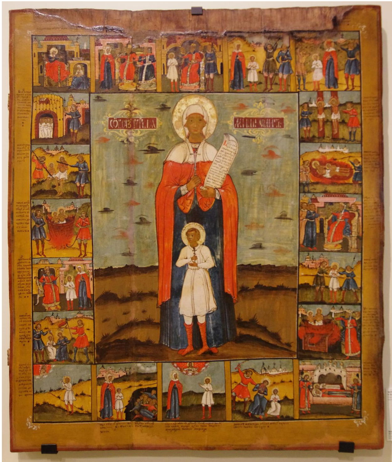
Figure 3. An anonymous icon depicting Version 1 ("Русский Север: Выставка в Государственном историческом музее," image courtesy of Мой виртуальный музей, https://www.myvirtualmuseum.ru/text/moscow/gim/russiannorth.htm ).