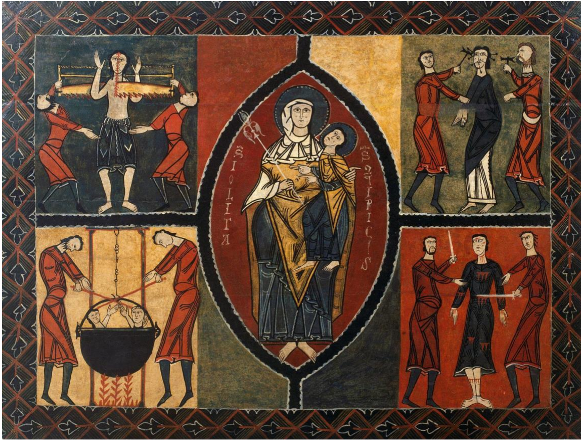
Figure 1. This 12 th century altarpiece comes from Catalonia. While the figure being tortured on their own appears to be an adult and therefore Julitta, note that Julitta's hair is covered in the central image and in the cauldron, while the tortured figure has no such covering. This, along with the fact that Cyricus is the protagonist of Version 1, which this depicts, points to him being the tortured figure, following a well-documented artistic convention of portraying holy children as older than their actual age 569 ("Frontal d'altar de Durro,").