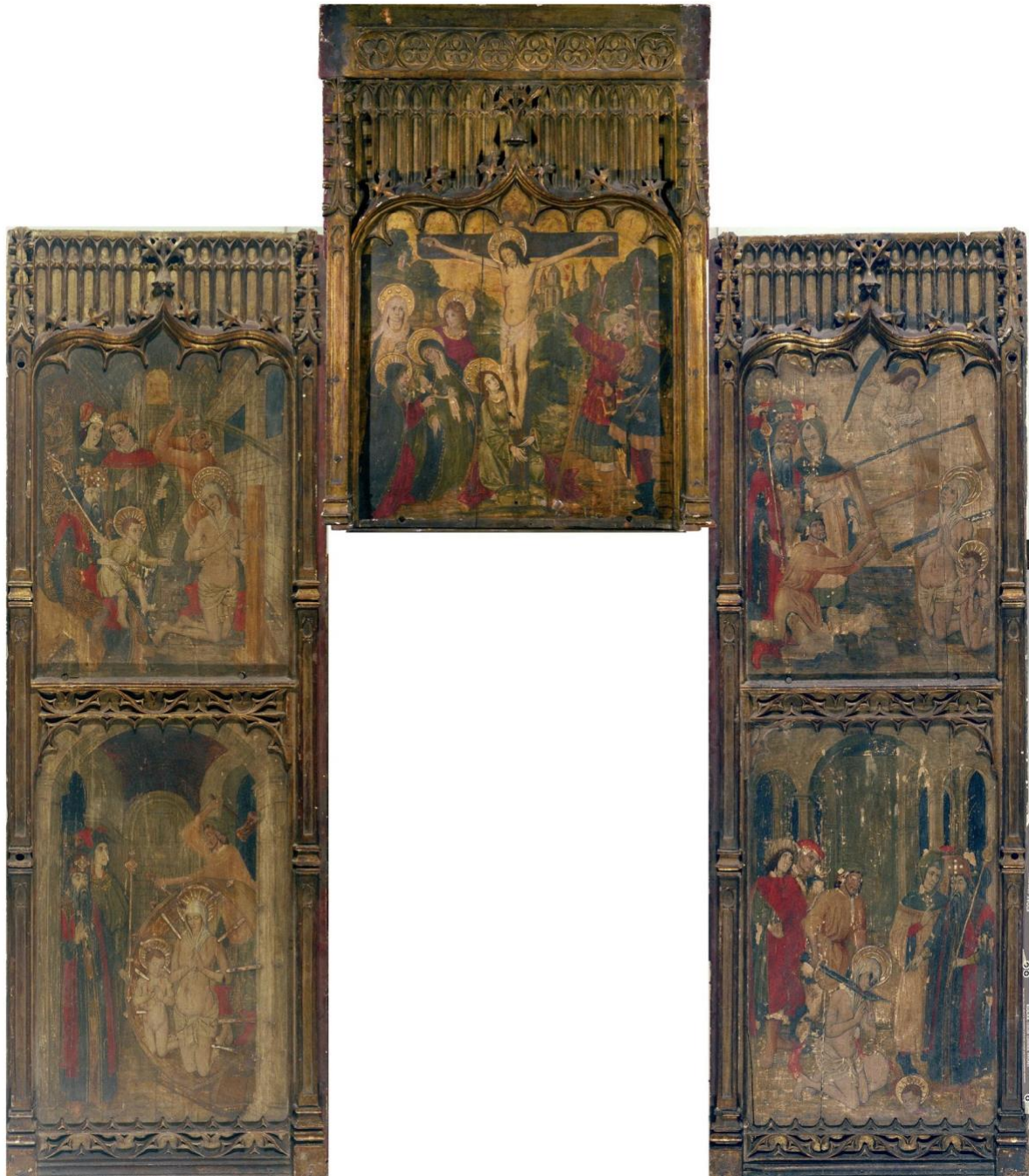
Figure 2. This 16 th century altarpiece comes from Sant Quirze d'Arbúcies in Catalonia. Version 2 is depicted in the upper left panel, while the other three panels dealing with Cyricus and Julitta follow Version 1 ("Retaule de sant Quirze i santa Julita,").