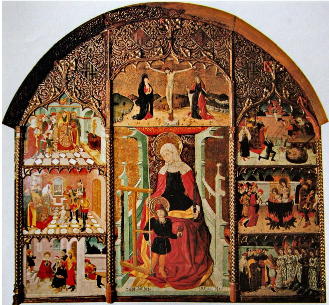
Figure 9. Altarpiece depicting Version 1 by Pere Garcia de Benavarri, a Catalan painter, around 1456 573 (“Retaule de Sant Quirze i Santa Julita de Pere Garcia de Benavarri (Catalonia),” ).