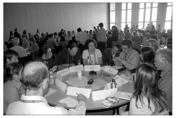
Figure 3 Participants in the Knowledge Café—'The Role of Corporations in Biodiversity Conservation, Corporate Social Responsibility (CSR) or Greenwashing?'

but no one raised a substantive question over the issues that the game eludes, such as the efficacy of offsets in conserving biodiversity. These observations point to the ways in which the artefacts of meetings—the use of PowerPoint technology, the arrangement of seats in a room, the format within which interaction is structured, the actions of a Chair—can act to control the circulation and reception of information, encourage the suppression of dissent, and encourage the disciplining practice of self-control. But the opportunity for engagement, the type of interaction that results, and the possibility of dissent depends, to a large degree, on who is in the room. At the WCC, structuring who was in the room was a highly orchestrated affair.