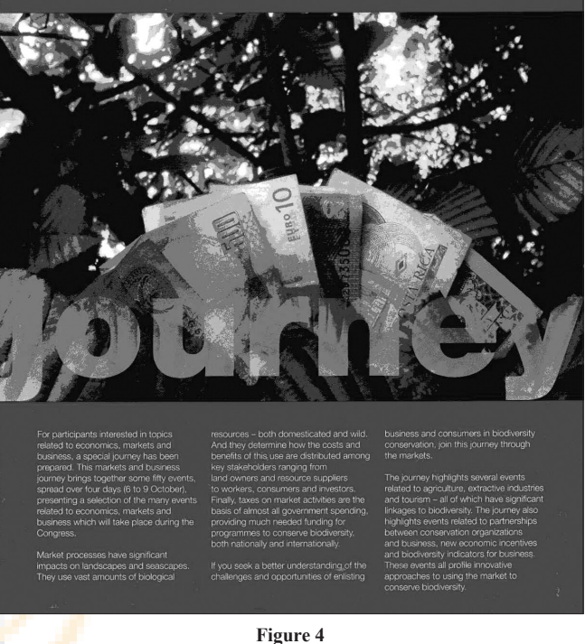
The cover page of the 'Markets and Business Journey' suggested a reworking of the old English idiom 'Money does not grow on trees'

and reporting.<sup>31</sup> Notably, however, journeys were not simply disaggregated events that pieced together random sessions, they were highly coordinated. And it is this coordination, exposed in part through elements of structure, that provides certain insights into the ways in which events like the WCC are orchestrated, the outcomes sought through that orchestration, and how such orchestration can open windows into the ideological and material struggles occurring within the organisation.