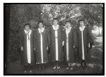
Worcester Seniors I, 1922