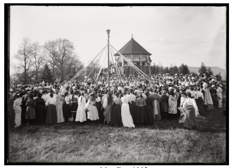
May Day 1902