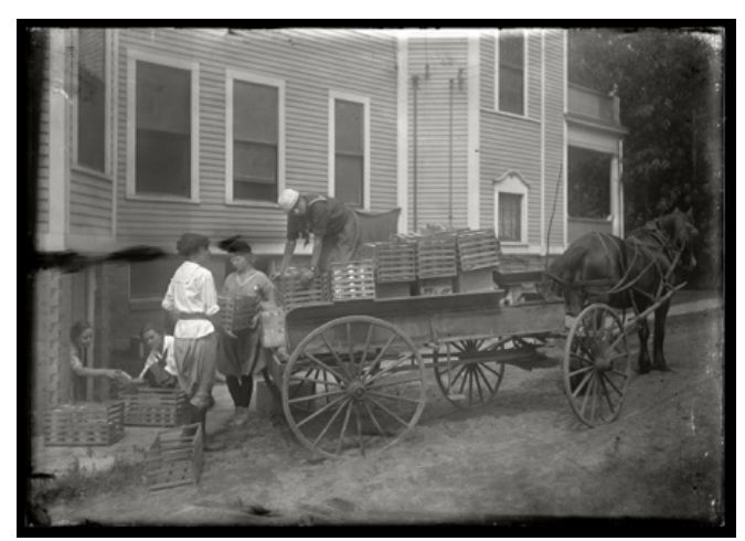
Farmerettes at Work, 1917-18