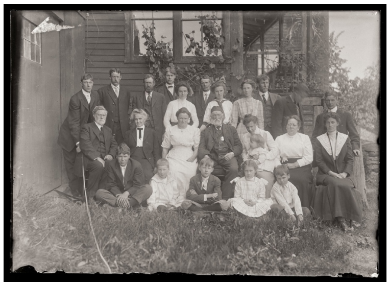
Kinney's Worcester Family, c. 1896

The vast number of Kinney's photographs is an exhilarating bounty but it's more than a little frustrating when it comes to discussing them. How to choose a reasonable number to discuss while being fair to the whole archive? So few are reliably dated that there's no hope of using chronology as an organizing scheme. His technique showed no evolution of early, middle and late that could have given stylistic sequences and approximate dates. Moreover, his subjects are so varied that there's no satisfactory set of categories that offers a logical way of sorting them. As a consequence, I've simply divided them arbitrarily into groups that loosely cohere and that seem to me to evoke the college's culture and its physical setting in the first three and a half decades of the twentieth century. Another person would probably include many of the photos I've chosen but in different configurations and with different exemplars. I nonetheless believe that my choices will form an attractive sampling that fairly characterizes this abundant treasury of images.