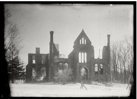
Williston Fire, 1917

is one of two posed photographs of this group at work, with Talbot in the left foreground; there are only slight differences in the two.