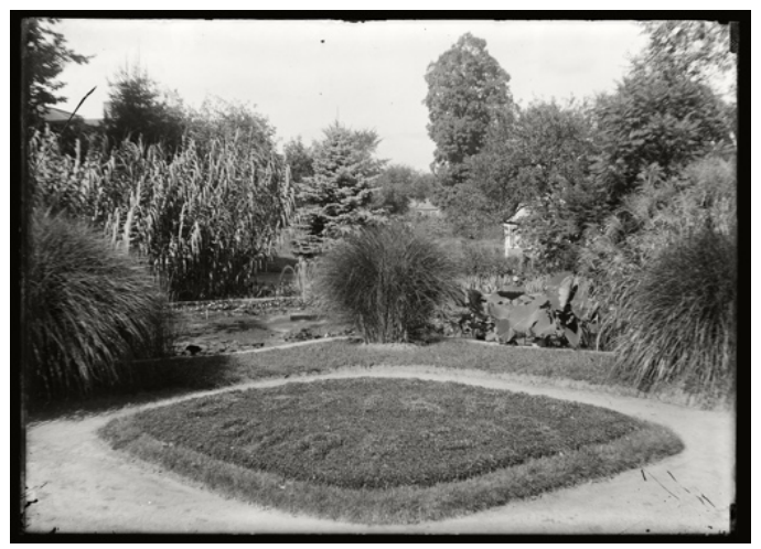
Dwight Garden and Lily Pond, 1904

Kinney's work with the college gardens has been summarized in the initial portion of this essay. No other documents have been found to add to this Spartan account, but an album of his photographs, with occasional remarks, can take us further. Dwight Garden with Lily Pond , 1904 shows a prominent focal point of the garden's path, with the lily pond in mid-distance.