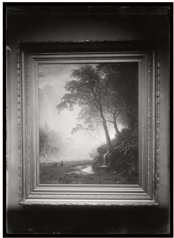
Bierstadt: Hetch Hetchie Canyon