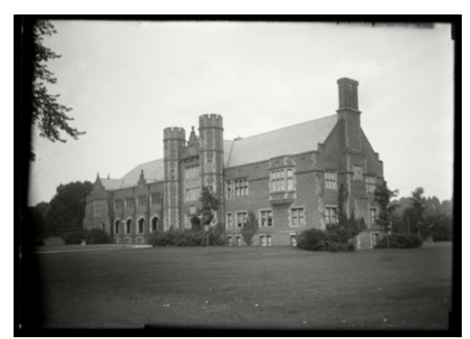
Mary Woolley Hall, 1916