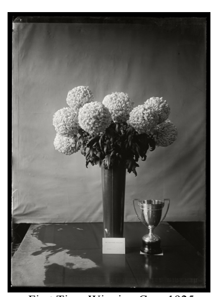
First Time Winning Cup, 1925