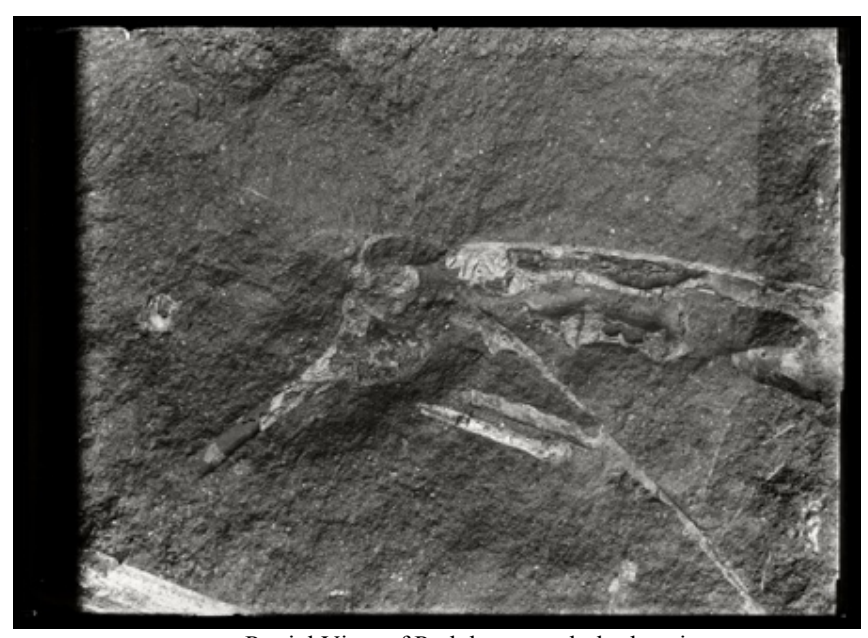
Partial View of Podokesaurus holyokensis