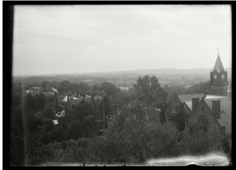
View from Clapp Laboratory, 1925-30

left. In Campus from Prospect Hill, 1910-15 , Goodnow Park provides the picturesque foliage. In mid-distance is the prominent Wilder Hall and the original Blanchard Hall.