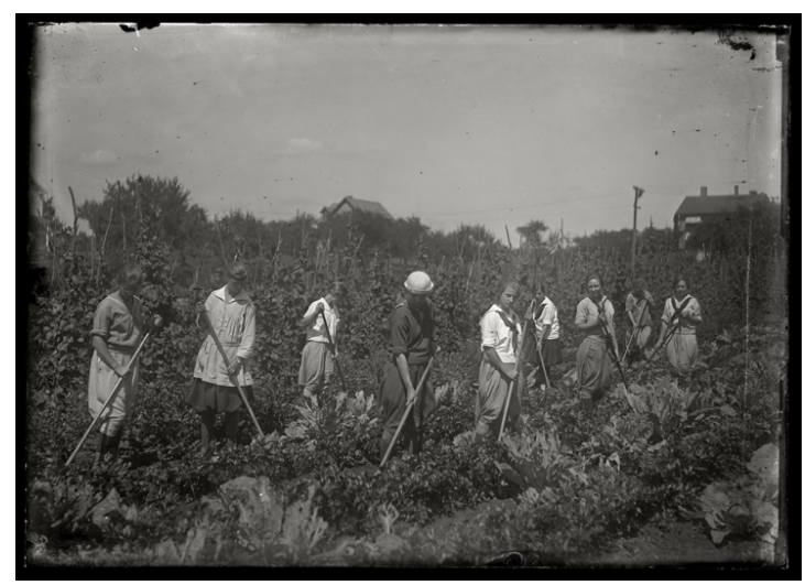
Farmerettes Hoeing Vegetables, 1917-18

In this and a few other war garden pictures, one or more of the women look up at Kinney. His presence is therefore felt, so he becomes part of the scene as we register it. More common are pictures for which he asked the students to look busy but not at him in order to make a more anonymous picture. Stripping Wartime Corn , 1917-18 is one of these. Indoors on campus, the women wear skirts, relegating bloomers and knickers to the outdoor gardens. Apparently they're boiling the corn, probably for the "inadequate" capping machine of which Kinney was "the vigorous manipulator" according to Stokey's memoir. This is not a casual photo, a "caught moment," for Kinney artfully arranged the scene. On the left the women look rightward, and on the right, leftward. This encloses the composition, which is strongly lit from the window. Its reflections and shadows along the floor activate and unify this interior.