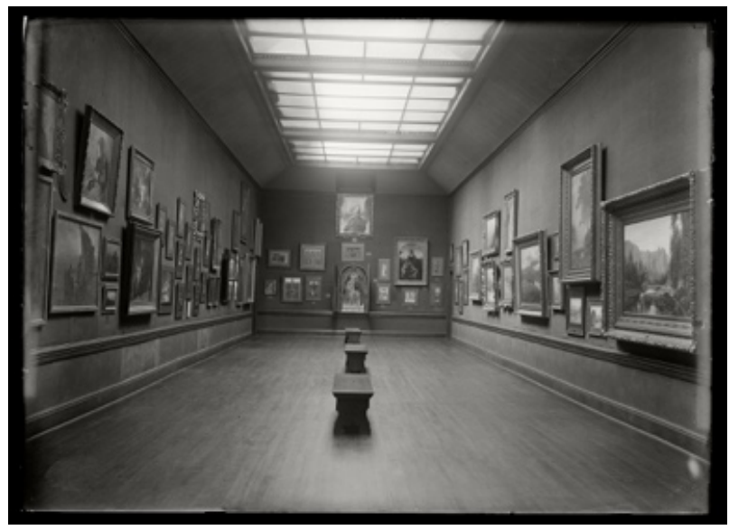
Dwight Painting Gallery, c. 1925