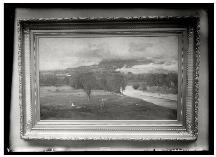
Inness: Saco Ford, Conway Meadows

In 1902, the crowded rooms of Williston gave way to the new Dwight Art Memorial which finally separated art and the natural sciences. From 1897 Fitz-Randolph had led a vigorous campaign for a new art building. Kinney had not photographed the art in the old building but in 1904 he turned his camera to Dwight. Unfortunately, only a few of his photos are dated. In his booklet Views of Mount Holyoke published in 1904, Kinney included a view of the sculpture gallery nearly identical to a later one of his that is dated circumstantially Sculpture Gallery , c. 1927. There were few changes between these dates. Apparently at the same time he photographed this room from its other end.