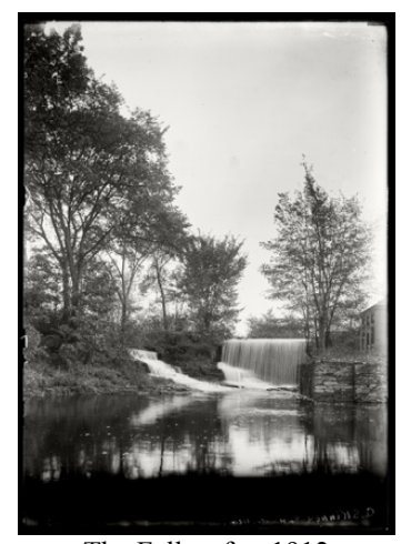
The Falls, after 1912