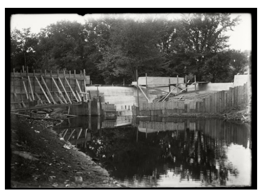
Dam under Construction, Upper Lake, 1912