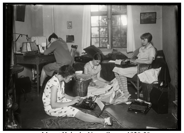
Mount Holyoke News Group, 1928-30