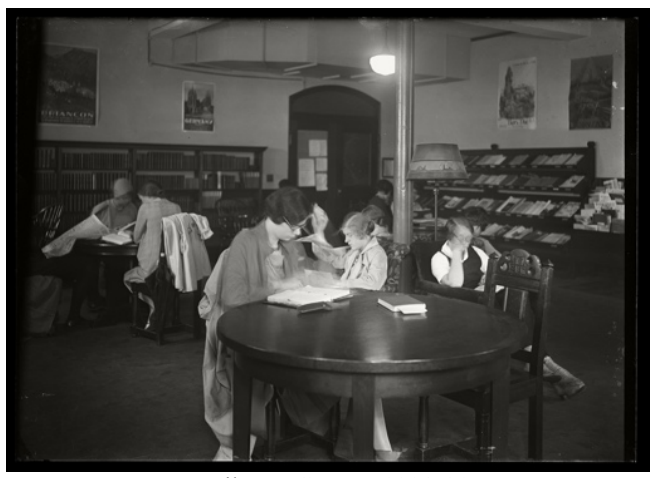
Library Corner. 1928-30