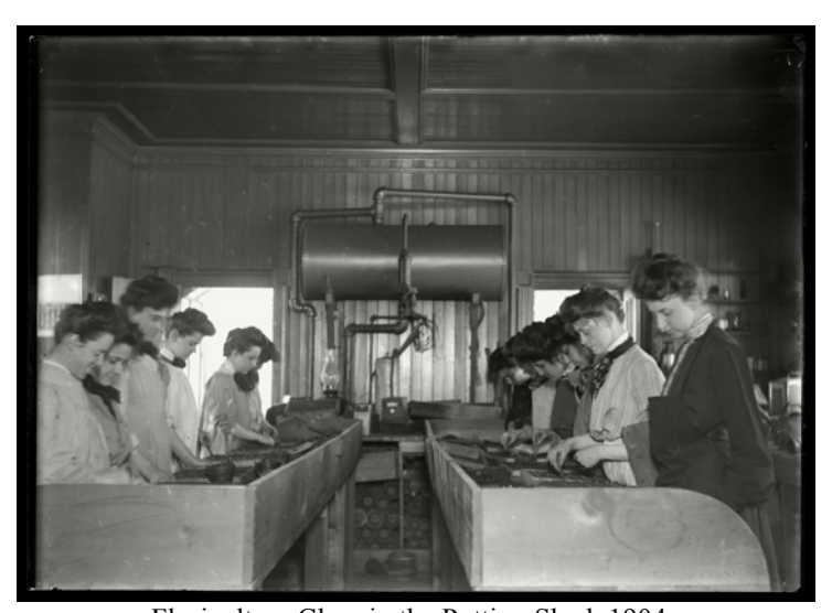
Floriculture Class in the Potting Shed, 1904

In Floriculture Class in the Potting Shed, 1904, about a dozen students are at work in a roofed-over part of the shed. They wear protective loose smocks, but if they walked about campus they would dress in long skirts, as do the four women preparing grafts for a small tree in " Plant Culture Class, 1906 ". A sign of the early twentieth century is their hair tied in a bun and piled high on the head.