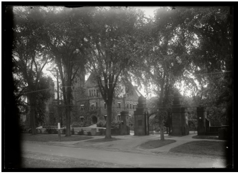
Mary Lyon Hall from College St., c. 1910