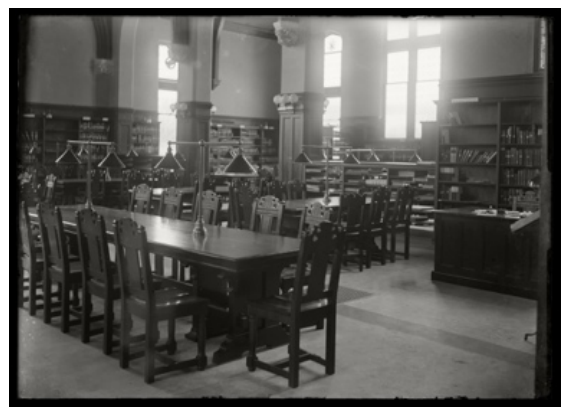
Reading Room Tables, c. 1910-12

Two photos of 1911 have even-lighted sharp images of science classrooms: "Psychology Lab" and "Philosophy and Psychology: Psychology Lab". These are both Kinney's titles, although the latter with its turning forks and biological charts would more appropriately today be called a physiology room. It's a smaller room that houses various instruments, including on the right the colored Maxwell disks that are spun to create uniform hues.