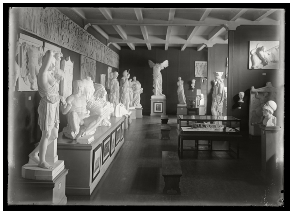
Sculpture Gallery, 1927

Other photos were taken about 1930, when there were a reduced number of casts on view that were now more widely spaced, as in Sculpture Gallery , c. 1930 , which should be seen alongside the photo of the same gallery in 1927. It would seem that the museum decided to favor a display more suited to visitors than the former arrangement which had maximized the objects with students in mind. The same ventilation took place in the main gallery, as shown in two more Kinney photos. Dwight Painting Gallery , c. 1925 presents the rather crowded installation of paintings on the top floor sometime in the 1920s. On the right, Bierstadt's Hetch Hetchie Canyon is second from the near corner, and Inness's Saco Ford: Conway Meadows is to its left. On the opposite wall near the viewer is Louise R. Jewett's Old Peasant Woman Plaiting Straw , 1893, which hangs above Edwin White's The Returning Pilgrims . The rear wall has a copy of Raphael's La Belle Jardinière . When we look into the gallery about 1930, we find the same streamlining of the pictures that took place in the sculpture room. To the right there are now ten pictures instead of sixteen; the far wall reveals a more drastic cut from fourteen to four. These changes suggest that more visitors to the museum were now anticipated.