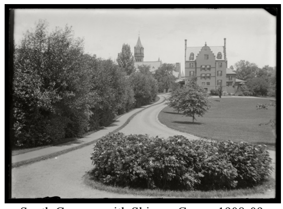
South Campus with Skinner Green, 1908-09