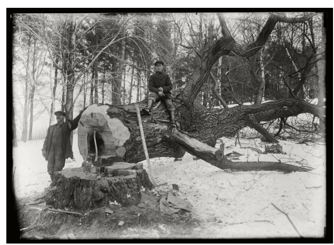
Felled Chestnut Tree, 1920