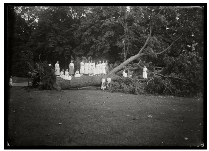
Fallen Black Walnut, 1917

Burned and torn down college buildings were not the only losses that Kinney documented. Dear to his heart were memorable individual trees that toppled over. In 1917 he photographed Fallen Black Walnut , a gigantic specimen of historic interest that had been leveled in a storm; its roots were rotten. More than century old, it was 102 feet high with its circumference at the base of fifteen feet. He asked a bunch of students to stand and sit on it for a memorial picture. As the campus "tree man"—yes, he was called that—he would have keenly felt its demise. It's one of the many occasions when we dearly wish we had a diary or other expression of his feelings. Three years later he would have been equally moved when he had to order the felling of a huge chestnut, victim of the blight which ravaged the Northeast, Chestnut Tree Felled , 1920. At other times he must have welcomed the opportunity to have a large tree rolled to a more suitable location. Moving a Hawthorn , 1931 enlivens a work-a-day winter scene, and it would have been Kinney's pleasure to see it leafed out in its new spot near the library, Hawthorn Tree Replanted , 1931.