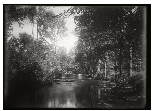
Stony Brook and Little Falls

Turning in the opposite direction from Iron Bridge, in Stony Brook and Little Falls he photographed the "Little Falls" and its bridge by the Pump House, which is here nearly hidden by the plentiful foliage that shrouds both banks of the brook. Before Kinney arrived at the college the brook's banks were less covered in foliage, and views from the same vantage point as his showed the brook's course very clearly. Moreover, before 1900 local photographers had used their cameras to pose groups of students on the exposed bridge (no men among them but it was called "the kissing bridge"); the falls and the pump house were then fully open to view.