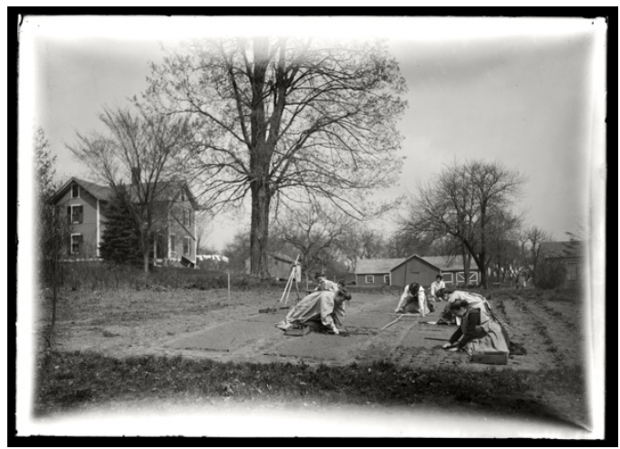
Floriculture Class Weeding Garden, 1905

In Floriculture Class in the Potting Shed, 1904, about a dozen students are at work in a roofed-over part of the shed. They wear protective loose smocks, but if they walked about campus they would dress in long skirts, as do the four women preparing grafts for a small tree in " Plant Culture Class, 1906 ". A sign of the early twentieth century is their hair tied in a bun and piled high on the head.