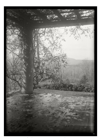
President's Porch, 1920s