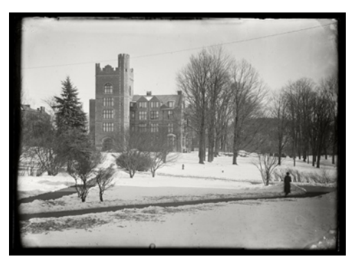
Clapp Laboratory, c. 1925

To compose broader picturesque views Kinney frequently took advantage of the school's open spaces that are like lungs which let the campus breathe. He photographed Clapp Laboratory from the library on a winter day not long after it was erected in 1924.