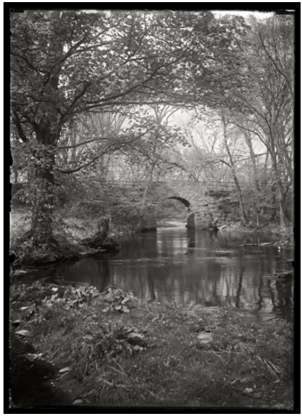
The Stone Arch, 1910