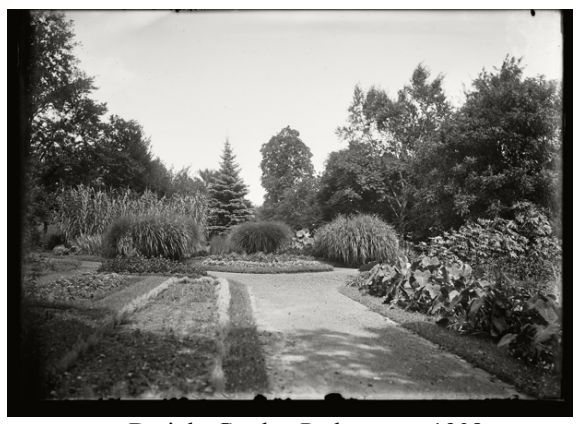
Dwight Garden Pathway, c. 1908

The same path taken from further back, is featured in Dwight Garden Pathway, c. 1908 . On the left are the geometric plots which characterized the garden until the "Class of 1904 Garden" supplanted it with a more "natural" plan in the mid-1930s. Through the years the Lily Pond was a central feature, together with luxurious beds of ferns that responded in part to Alma Stokey's specialty.