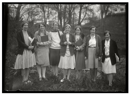
Plant Culture Class, 1929

The earlier shows ten women in skirts reaching to their feet, the later has seven women in skirts just covering their knees. The contrast is not only in fashion but in the greater degree of naturalism in the later photo. In 1907 the women's full dresses and their sober demeanor give them a stiffness for the long moment required. In the 1929 photo, the group smiles warmly at their teacher, their arms are not in the rigid positions seen in the earlier photo, and their modern