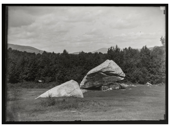
Balance Rock, Pittsfield, 1904

Several of Kinney's plates represent Berkshire's rolling landscape, including two of glacial erratics, Pittsfield's Split Rock and Balance Rock just north of the city. These are isolated boulders transported by moving glacial ice, the kind found frequently in the Northeast that became local sights.