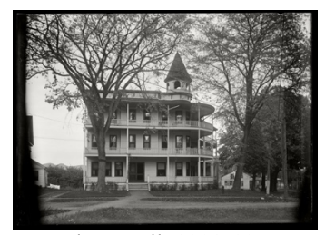
Judson Hall, 1908-10