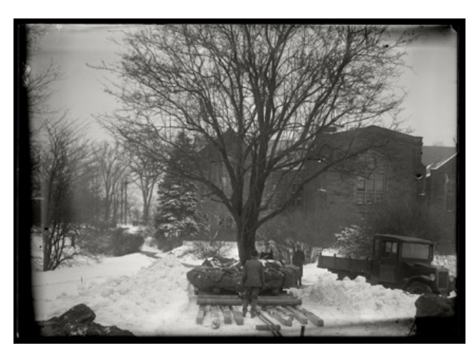
Moving a Hawthorn, 1931