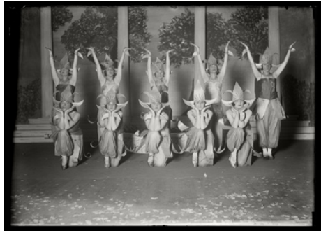
Junior Show 1922: Pagoda Girls