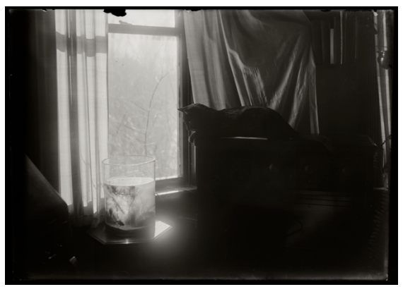
Cat and Goldfish

In some photographs of the household Kinney took time to make artfully composed images. In Cat and Goldfish , the cat, silhouetted against broad folds of a curtain, peers down at a goldfish bowl. The light comes toward us from a window whose outdoors objects are veiled in a vaporous bright grey: pure light without objects. It illuminates only a third of the room which is otherwise so dark that it's difficult to pick out its furnishings. Thanks to contrast, it renders glass bowl and water as tactile translucent receptacles. They mesmerize the cat who stretches atop a