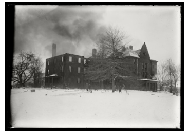
Rockefeller Fire, 1922