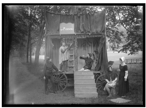
Speech Play, 1930