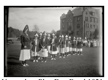
Upperclass Play Day Band 1921

Far more numerous are simple line-ups like "Senior Volleyball Team, 1921." Indeed, Kinney took about 150 such photos of sophomore, junior and senior sports teams, solemnly facing his camera with only an occasional smile. We can assume that he made copies for the students to have for themselves and to post in the locker room. It's possible that the college asked for these photos, but no sign of this has yet surfaced. Kinney did not take stop-action photos, so typical of his hesitant approach to motion is a photo of 1930, "Hiking 1930s: Press Club," where three women walk up a slope, pausing in stride to look at the camera. Kinney often accompanied students on outings, and perhaps thought that this photo would be useful publicity for the press club.