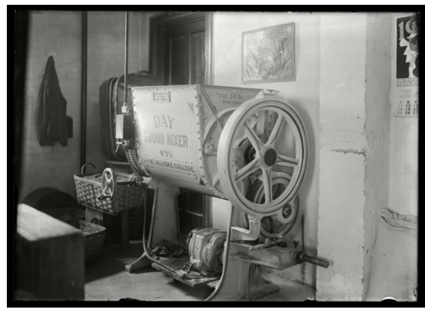
Dough Mixer, 1928-30