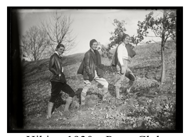
Hiking 1930s: Press Club