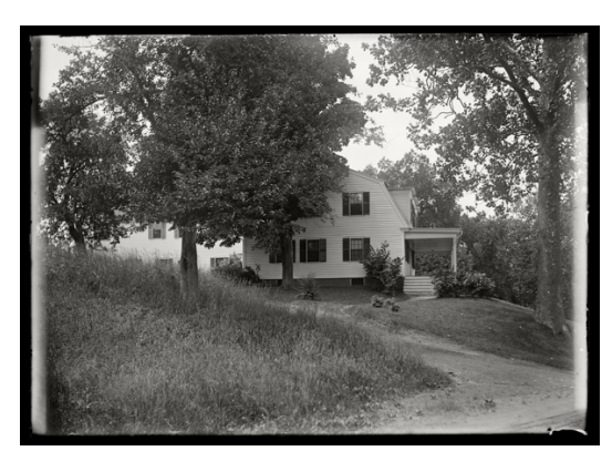
Cowles Lodge, c. 1925