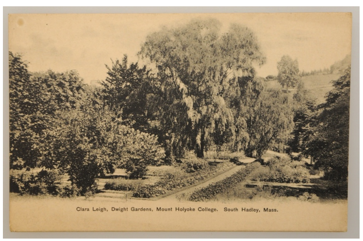
Dwight Gardens Postcard, c. 1905

another of the club. <sup>40</sup> So from the beginning, he made photography an integral part of his life at the college. Shortly after he began teaching, he captured college buildings and landscapes with his tripod and camera, revealing his ambition to enter the commercial and public realm. He began publishing postcards of picturesque views of Stony Brook and its bridges, of Prospect Hill and its Goodnow Park, and of college gardens and buildings. <sup>41</sup> Given his work on gardens, it's not surprising that he produced postcards entitled "Lily Pond," "Dwight Botanical Garden," "Clara Leigh Dwight Garden," and the like, each with the legend "Mount Holyoke College, South Hadley, Mass."