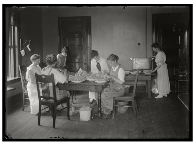
Stripping Wartime Corn, 1917-18

In this and a few other war garden pictures, one or more of the women look up at Kinney. His presence is therefore felt, so he becomes part of the scene as we register it. More common are pictures for which he asked the students to look busy but not at him in order to make a more anonymous picture. Stripping Wartime Corn , 1917-18 is one of these. Indoors on campus, the women wear skirts, relegating bloomers and knickers to the outdoor gardens. Apparently they're boiling the corn, probably for the "inadequate" capping machine of which Kinney was "the vigorous manipulator" according to Stokey's memoir. This is not a casual photo, a "caught moment," for Kinney artfully arranged the scene. On the left the women look rightward, and on the right, leftward. This encloses the composition, which is strongly lit from the window. Its reflections and shadows along the floor activate and unify this interior.