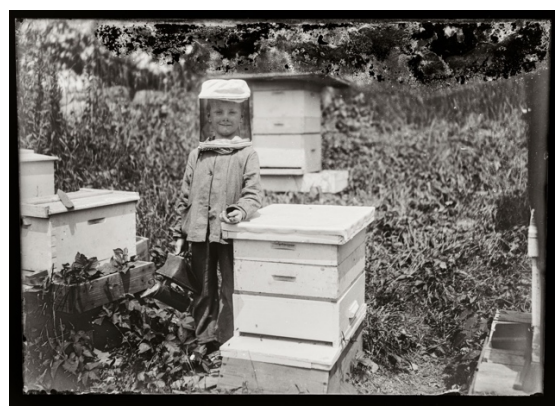
Foster Caring for Bees, c. 1913