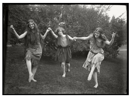
May Day Nymphs, 1921

A good many capture theatrical groups that participated in May Day celebrations. Among the most amusing of Kinney's photos is "May Day Dancers, 1922." Six women in elaborate costumes hold spectacular pear-shaped panels above their heads with the aid of slender rods. What was their dance? One can't resist speculating on how these women moved about. Their large panels would have caught the slightest breeze but even without a breeze, they would have been difficult to control. One of Kinney's rarely exuberant pictures is "May Day Nymphs, 1921," a close-up of three dancers in loosely flowing garments with linked hands. Two of them grin as they raise a leg.