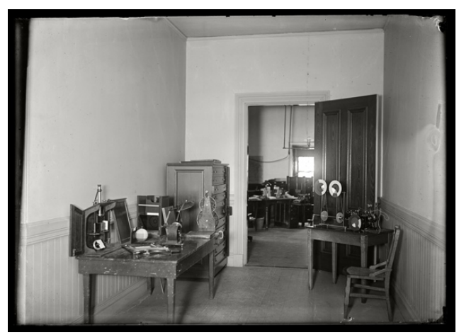
Philosophy and Psychology Lab, 1911