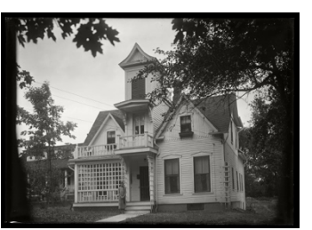
Kellogg House, c. 1925