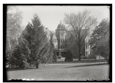
Safford Hall, c. 1905