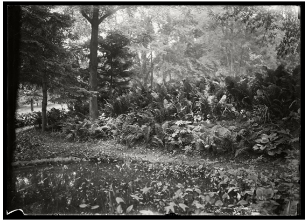
Dwight Lily Pond and Ferns, 1922