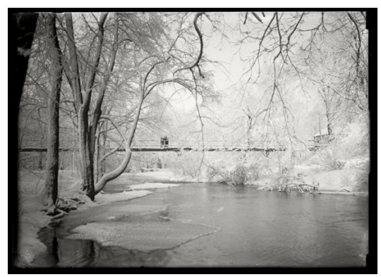
Cowles Lodge Bridge, 1929