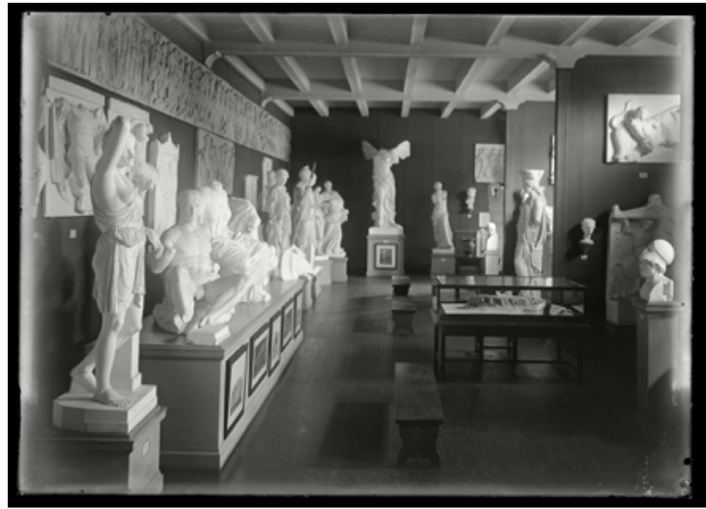
Sculpture Gallery, c. 1927