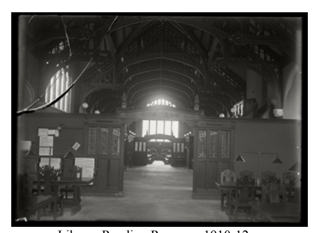
Library Reading Room, c. 1910-12

Kinney photographed the interiors of college building less often than the outdoors but we've already looked at photos of theatrical presentations and a few of the greenhouses, his own campus domain. During the first ten or twelve years of the century he took a few views of classrooms and the library. Like his pictures of campus buildings, these are unpeopled and conform to the idea of a timeless institutional fabric. Library Reading Room shows off the large Tudor room with a long central axis that flatteringly reveals its structure. (The prominent cracks in this print show the fragility of Kinney's glass plates.) Reading Room Tables exalts the building's heavy wood furniture in pristine purity uncluttered by students, the kind of view to be forwarded to trustees and institutional publications.