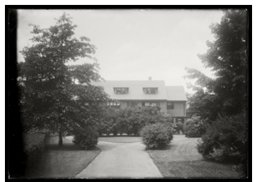
President's House, 1920s