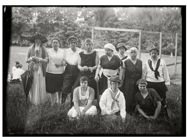
YWCA Convention, 1922