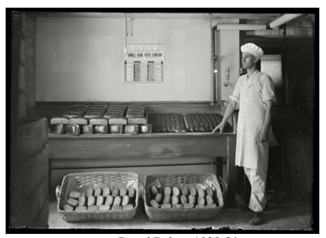
Bread Baker, 1928-30