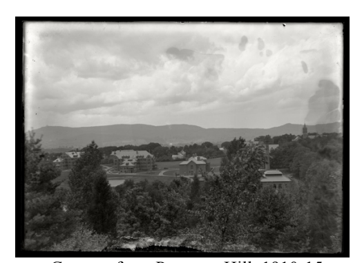
Campus from Prospect Hill, 1910-15

He also took dozens of views of the periphery of the campus. One of these is Steps to the Mandelles, 1925-30 . A large portion of it is still there, but one can imagine it a century or two earlier as the entrance to a picturesque grotto or cavern.