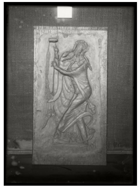
Saintly Figure, 1931