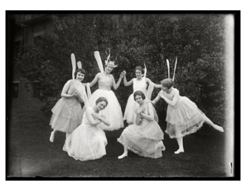
May Day 1921, Fairies