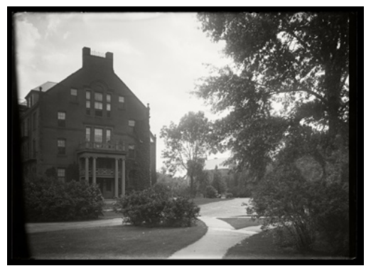
Mead Hall, 1930

giving it a dark background? (Three more photos of Porter Hall feature the same birch.) He pictured Mead Hall in 1930 at only a slight angle, but it was enough to turn our eyes toward the walkway and lawn that open out between the bushes and trees. He photographed Mead eight times, each with its ornamental setting. In contrast, his photos of the music building and Peterson's Lodge loom up starkly on plain lawns not long after they were built; they weren't yet graced by trees or bushes.