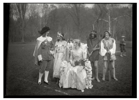
May Day Queen, 1929