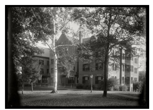
Porter Hall, c. 1908-10

Kinney photographed most of the campus buildings at an angle, so they penetrate space more than when taken flat on to their façades and they have more three-dimensional substance. Porter Hall, c. 1908-10 exhibits more of the building's mass than Safford but Kinney took it from a moderate distance so that campus trees rise up prominently; their foliage screens the sky to contribute a picturesque effect. Late afternoon sunlight comes from the right to illuminate the side of the structure, leaving the façade in shadow. Was this in order to exalt the white birch by