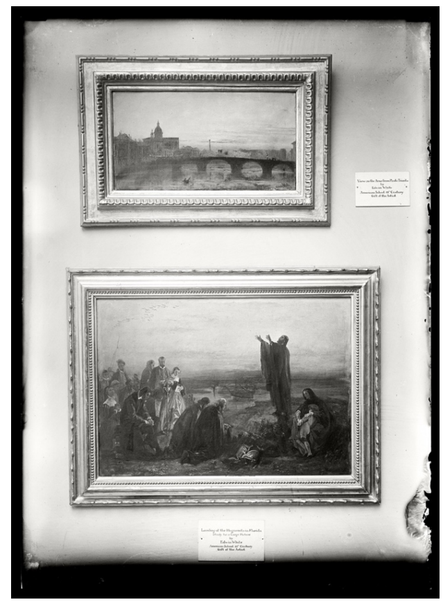
Paintings by Edwin White