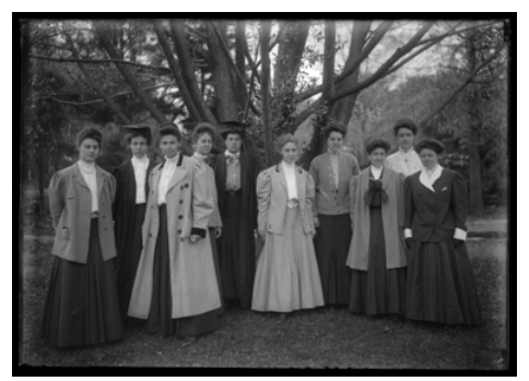
Plant Culture Class, 1907

Kinney mentioned and illustrated the war garden in the only public lecture among many he gave for which a good account exists. He spoke on plants on several occasions to local garden clubs, but this lecture was given before a Mount Holyoke audience. A Springfield paper in 1930 published a two-column account, "Girls' Styles Change More Than Modesty." It was accompanied by two of Kinney's photographs, "This is how the class dressed in 1907" and "Plant culture class of 1929 has changed its style of attire."