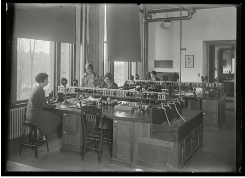
Clapp Hall, Miriam Lab, 1929