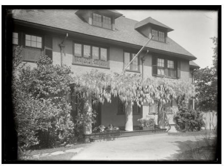
The President's Wisteria, 1920