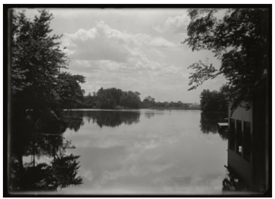
Lower Lake from Iron Bridge

Turning in the opposite direction from Iron Bridge, in Stony Brook and Little Falls he photographed the "Little Falls" and its bridge by the Pump House, which is here nearly hidden by the plentiful foliage that shrouds both banks of the brook. Before Kinney arrived at the college the brook's banks were less covered in foliage, and views from the same vantage point as his showed the brook's course very clearly. Moreover, before 1900 local photographers had used their cameras to pose groups of students on the exposed bridge (no men among them but it was called "the kissing bridge"); the falls and the pump house were then fully open to view.