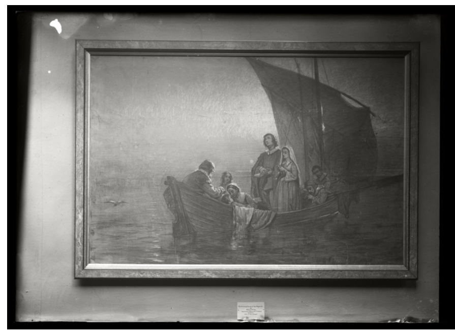
White, The Returning Pilgrims