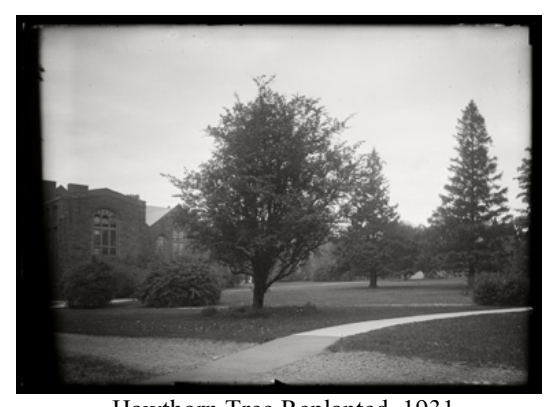
Hawthorn Tree Replanted, 1931

Most of Kinney's photos represent the central campus and its buildings photographed from ground level, but he also took views from Prospect Hill and from the roof of Clapp Laboratory. View from Clapp Laboratory, 1925-30 looks out over Dwight and Shattuck from a point that features tree foliage as much as the buildings. Shattuck is on the lower right and Dwight is to the