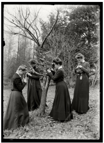
Plant Culture Class, 1906