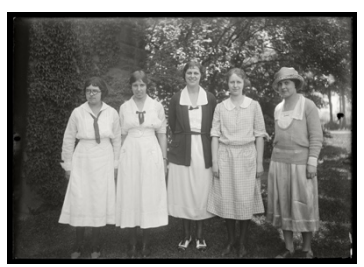
Worcester Seniors II, 1922

Worcester Seniors I, 1922 line up solemnly, not so differently from those in earlier years. The same young women now in ordinary dress are more relaxed in a second photo: Worcester Seniors, II, 1922. Maybe they wanted to get away from the usual stiff poses in graduation garb, or maybe Kinney suggested an informal presentation.