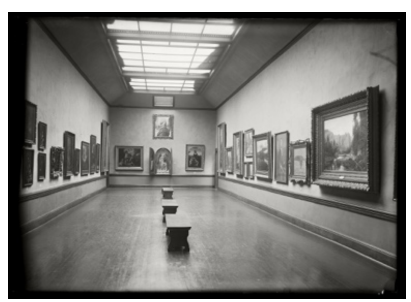
Dwight Painting Gallery, c. 1930

From the early 1930s the college's more forward-looking museum gradually began to acquire more original paintings, sculptures, ceramics and prints. By the end of the second World War the collections rose in significance and the copies which had been a mainstay of instruction were relegated to storage. The opening of the new art building in 1971 was the occasion of a significant number of gifts. In recent years the collections of Asian, modern and contemporary art have grown considerably and the museum's several rooms that display art of many generations and cultures has become a distinctive destination for art lovers.