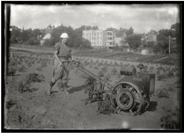
Tilling in Button Field, 1917-18

In the war garden, a sturdy farmerette has stopped maneuvering a heavy machine to pose for Kinney: Tilling in Button Field . Like other women of about that time she wears knickers adapted from men's golfing attire. We look across the future Ashfield Lane towards the large building on the corner of Bridgeman and Ashfield lanes; it housed faculty then, and still does. This tilling machine was quite modern (we can't help finding it amusing now), and so were some of the college's motorized trucks, but horse-drawn wagons were still in use.