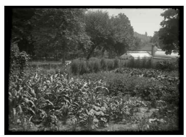
Vegetable Garden, 1910-15

Until the War Garden of 1917, there was a vegetable garden near the botanical plantings: Vegetable Garden, 1910-15 . It served the campus dining rooms, but we don't know how much food it provided. Of course Kinney used it for his courses in plant culture. He photographed half a dozen students in another vegetable garden in early spring: Floriculture Class Weeding Garden, 1905 .