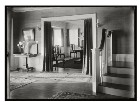
Interior of the President's House, 1920s