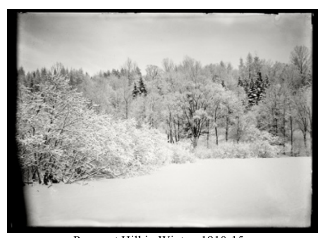
Prospect Hill in Winter, 1910-15