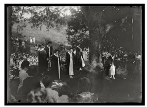
Tree Day 1920

Kinney photographed plays and outdoor campus rituals so often that they form the largest category of his pictures of the college. They had the attraction of quasi-public events, more lively subjects for a photographer than line-ups of athletes or club members. Of course he filmed Commencement ceremonies, including the "laurel parade," and such common activity as the choir filing in or out of the chapel, and the annual Tree Day on the downhill slope of Prospect Hill: " Tree Day 1920 ."