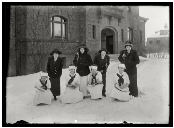
Junior Show, 1913

Many of Kinney's groups lack full identification although we know something of why they were gathered together. Fifteen musicians in marching order formed "The Upperclass Play Day Band, 1921," but what was the significance of their costumes and conical hats? The frontal row of "The Junior Show of the 13<sup>th</sup> Amendment Class of 1913" hold books which probably refer to the abolition of slavery in 1865, but what's the significance of their identical costumes? Why are they squatting down, and why are the others standing? The latter four are dressed mostly in black (three of them hold ice skates over their shoulders). Did Kinney pose these students because they gave him a pictorial black-and-white contrast, or did they recapitulate a portion of the Junior Show? He had choices of what to photograph from campus activities and perhaps was drawn to those that offered attractive contrasts.