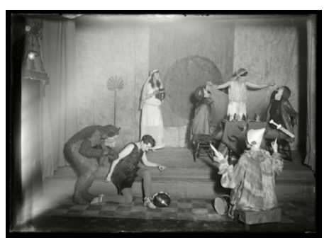
Speech Play, 1930