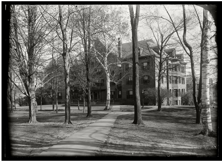
Porter Hall, Early Spring, c. 1908-10