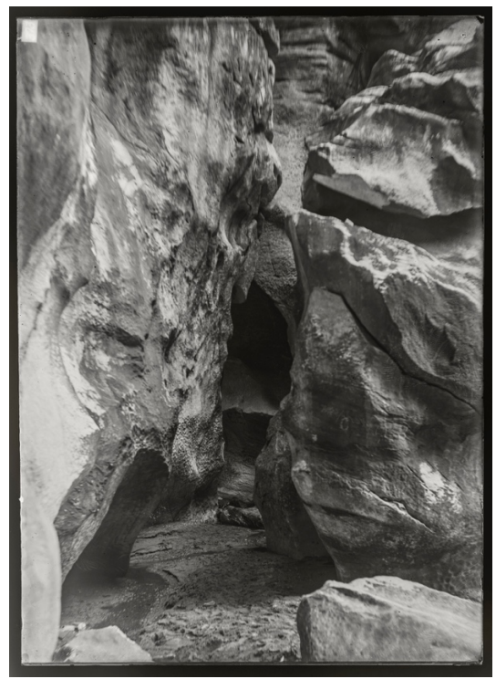
Natural Bridge State Park, North Adams, 1904