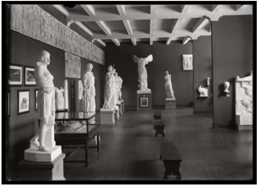
Sculpture Gallery, c. 1930