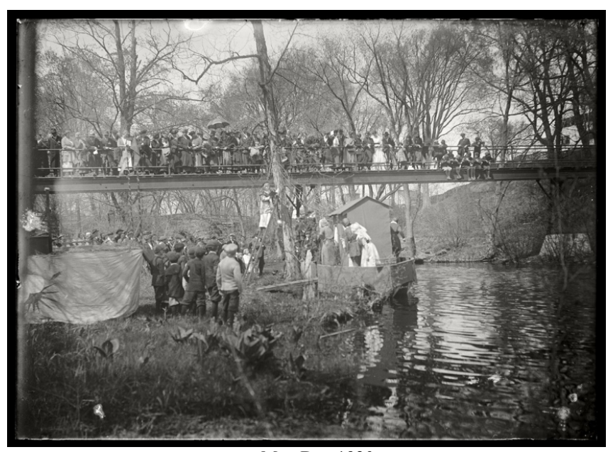
May Day 1920