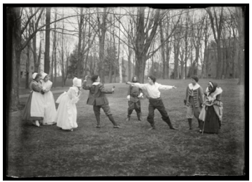
Sophomore Play 1908