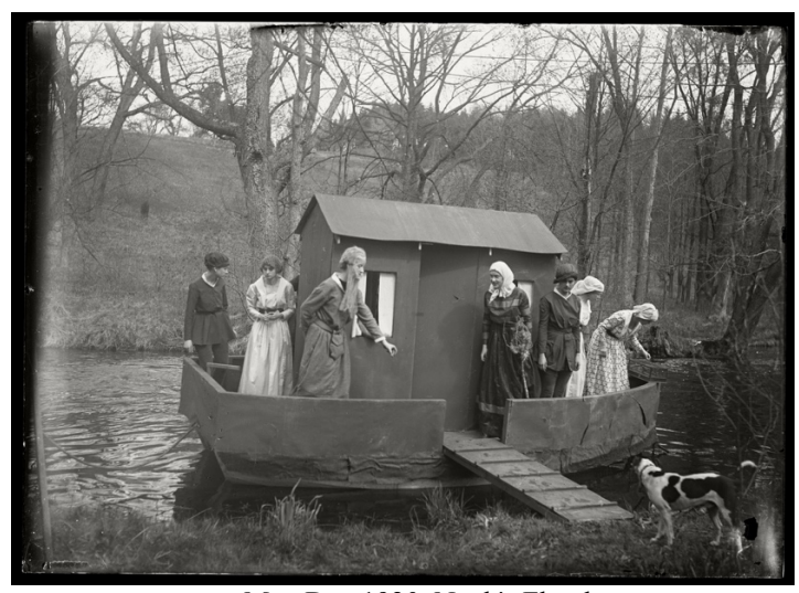
May Day 1920, Noah's Flood