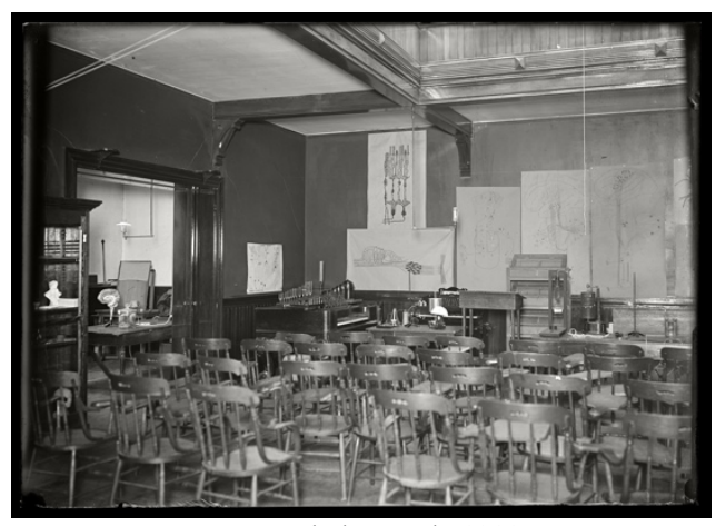
Psychology Lab, 1911

Two photos of 1911 have even-lighted sharp images of science classrooms: "Psychology Lab" and "Philosophy and Psychology: Psychology Lab". These are both Kinney's titles, although the latter with its turning forks and biological charts would more appropriately today be called a physiology room. It's a smaller room that houses various instruments, including on the right the colored Maxwell disks that are spun to create uniform hues.