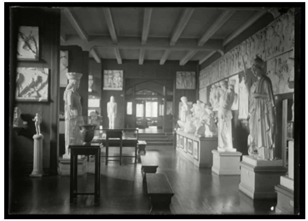
Sculpture Galley, c. 1927