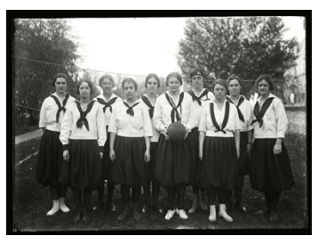
Senior Volleyball Team, 1921