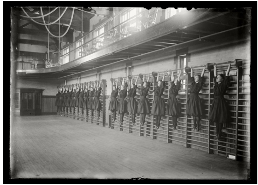
Gym Class, 1911