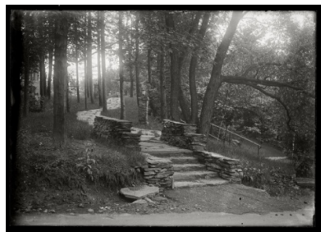
Steps to the Mandelles, 1925-30

He also took dozens of views of the periphery of the campus. One of these is Steps to the Mandelles, 1925-30 . A large portion of it is still there, but one can imagine it a century or two earlier as the entrance to a picturesque grotto or cavern.