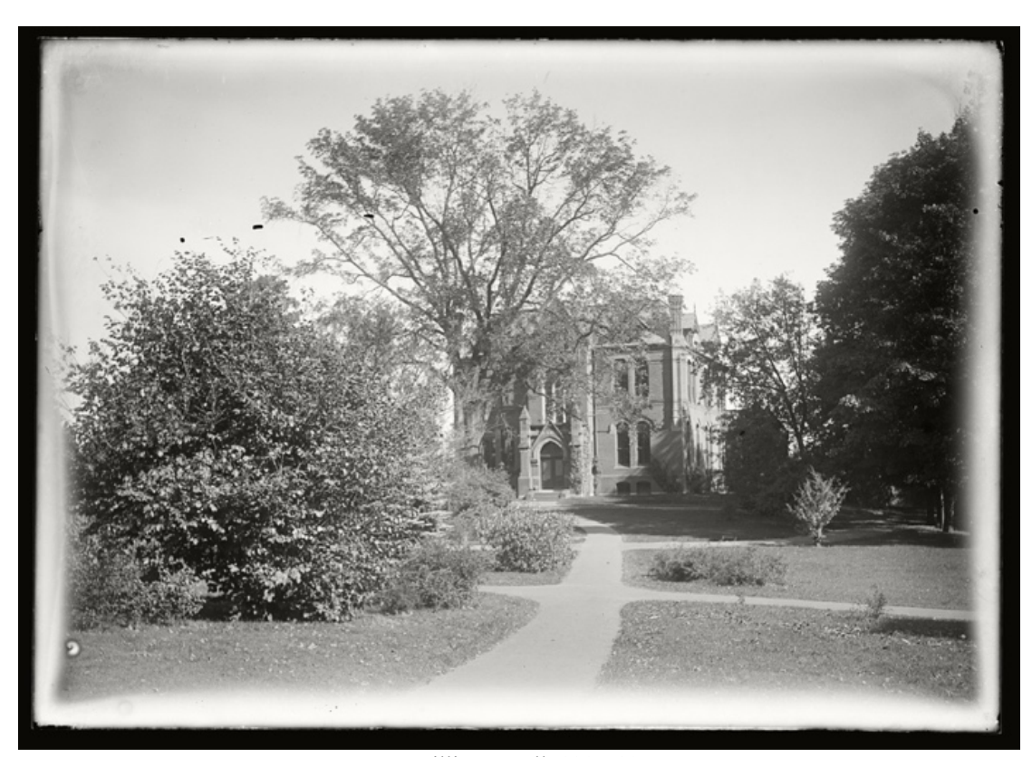
Williston Hall, 1905-10