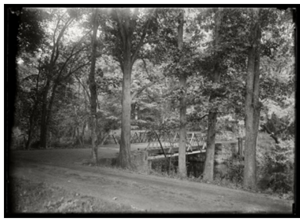
Iron Bridge from Lower Lake Road